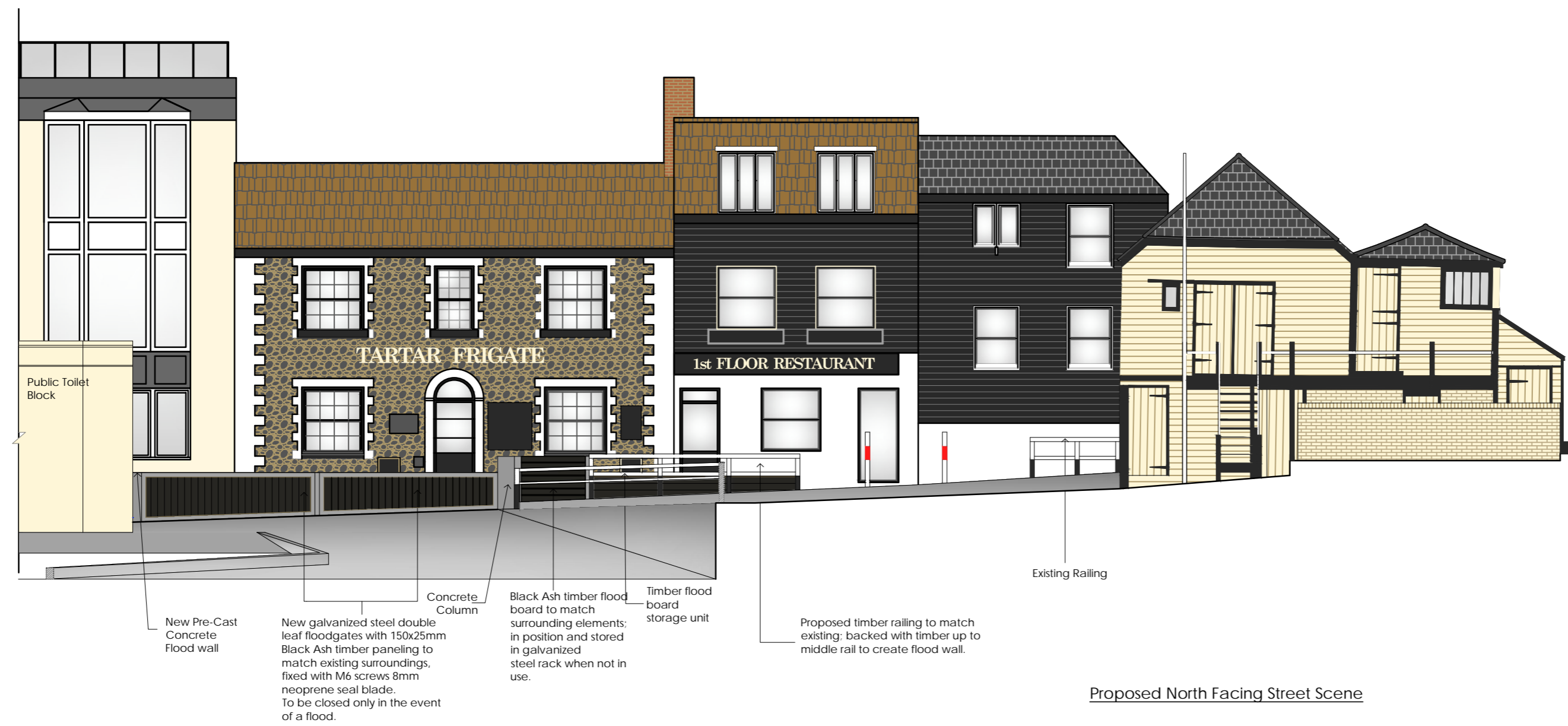
Proposed North Facing Street Scene

MATERIAL SCHEDULE Flood gates: Galvanised, Black Ash timber panelling to match surrounding. New timber railing: to match existing colour.